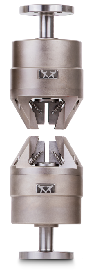
±3 kN, ±25 Nm pneumatic fatigue-rated wedge action grips