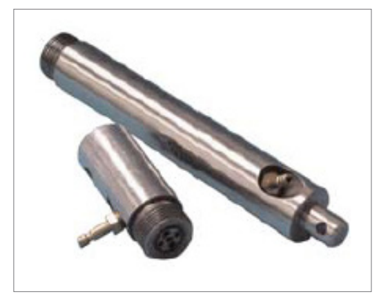
Upper and Lower Pneumatic Pull Rods