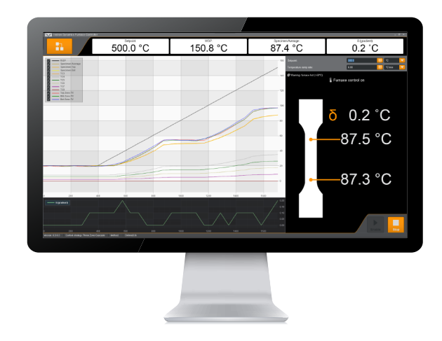
3117-301 Furnace Controller