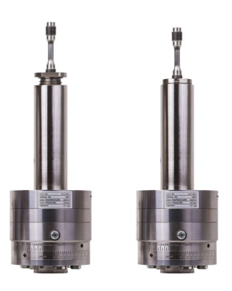
3117-501 LCF Pullrods