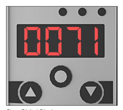
Clear Digital Display

When used with the electric micro-pump the grip controls are integrated to the 8800MT control panel. Close and open grips at the touch of a button and easily see the grip status with indicator lights.