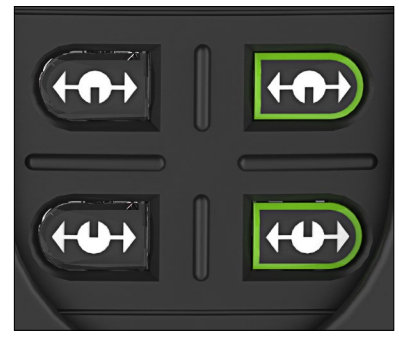
Integrated Grip Controls

As a technician it is important to be able to precisely set the preload on a specimen and achieve it consistently. While the technology to achieve this has been around for a long time, Instron is the first to utilise it in this application in simplifying and improving the quality of Low Cycle fatigue testing. It really is as simple as it sounds, set a pressure and push to close. Remove an unnecessary manual step in your test procedures and with it remove the variability between technicians.