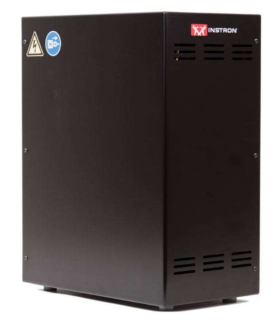
Self-Contained Electric Pump