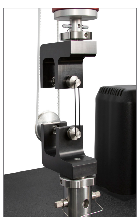
2717-078 on Dual Column machine