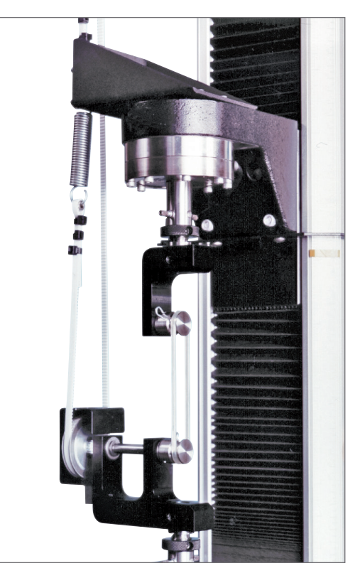
2717-068 on Single Column Machine