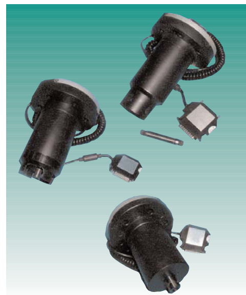
▲ 2525-800 series load cell

Instron load cells are tested for accuracy and repeatability on a calibration apparatus traceable to international standards, with an uncertainty of measurements not exceeding one third of the permissible error of the load cell. Accuracy has been found to be equal to or better than 0.025% of the load cell rated output or 0.25% of the indicated load, whichever is greater.