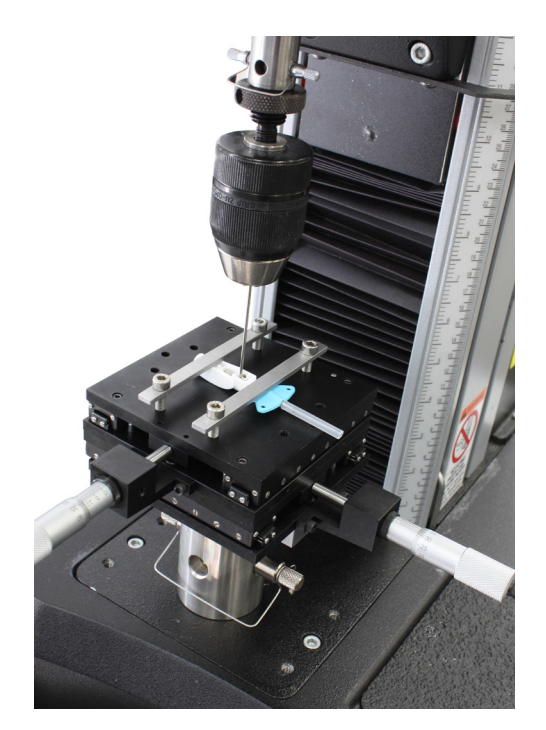
Push test of a catheter sub-assembly component

Compatible Frame Models: Single Column Systems - 68SC, 34SC, 594x, 334x, and 554x/ Dual Column Systems - 68TM, 34TM, 596x, 336x, and 556x