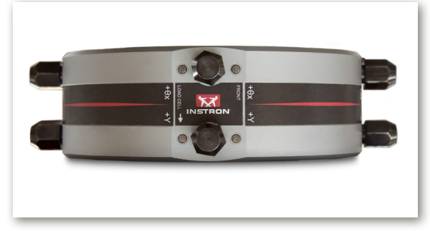
AlignPRO Alignment Fixture