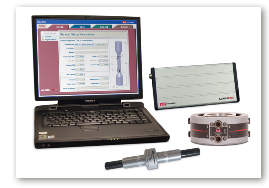
AlignPRO Alignment system

Custom alignment cell definitions can be created and stored in a local specimen database. The software also features a comprehensive reporting tool.