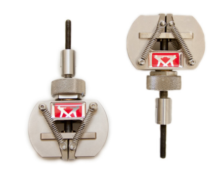
1 kN Mechanical Wedge Grips