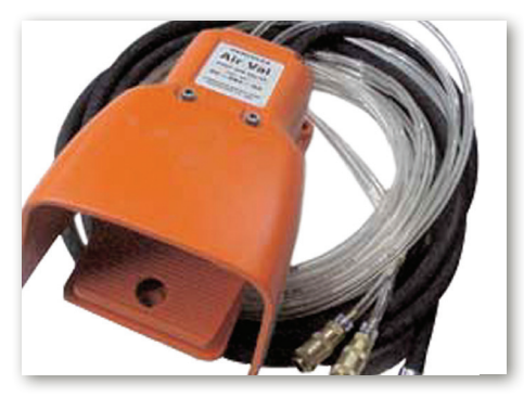
Pneumatic foot switch