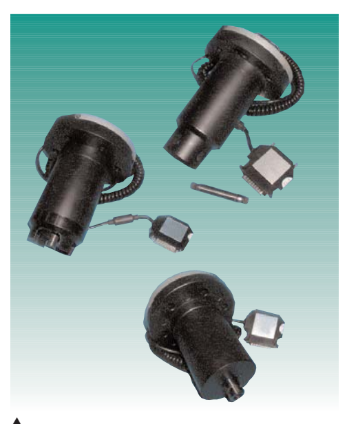
2525-800 series load cell