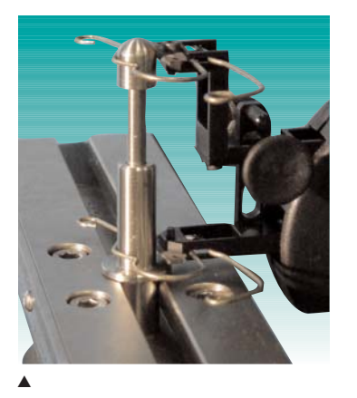
Deflectometer using clip-on extensometer