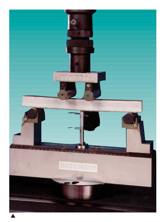
Four-point loading using mid point deflectometer