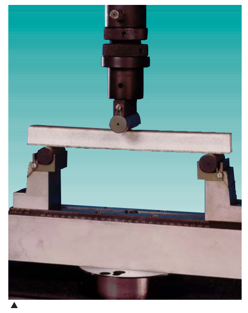
Three-point flexture fixture - three-point loading