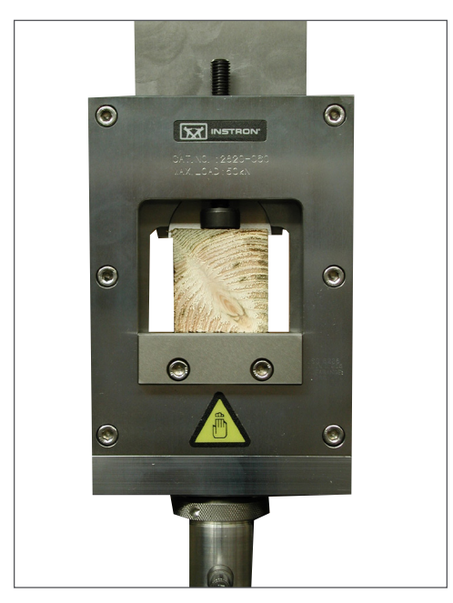
2820-060 Shear Fixture