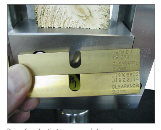
Shims for adjusting clearance of shear line