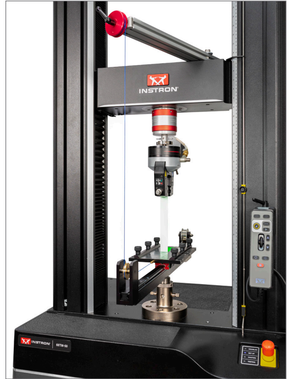
2820-035 90° Peel Fixture on 68TM-50