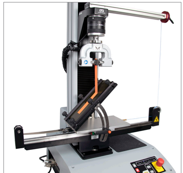
2820-036 Variable Angle Peel Fixture on 34SC-5