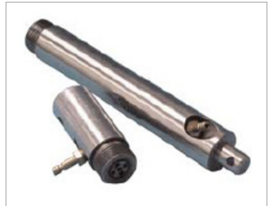
Upper and Lower Pneumatic Pull Rods